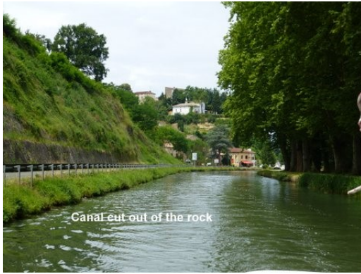
Canal cut out of the rock