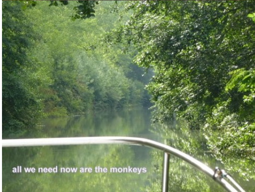
all we need now are the monkeys