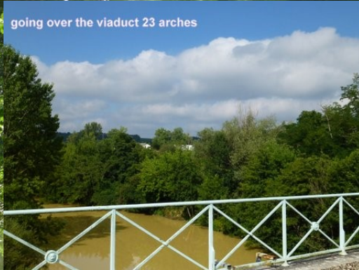
going over the viaduct 23 arches