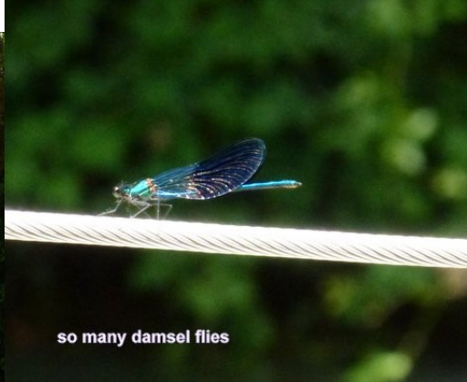
so many damsel flies