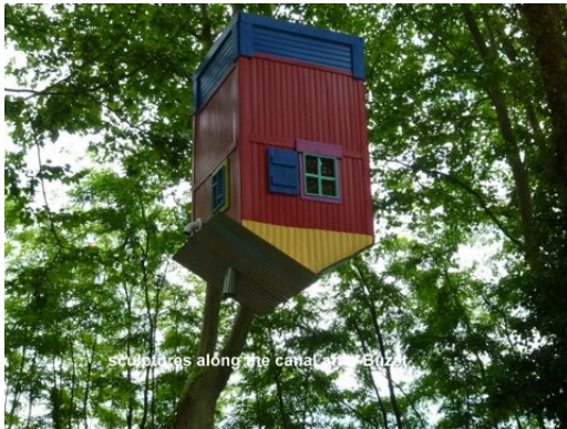
sculptures along the canal after Buzet