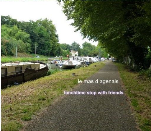
le mas d agenais lunchtime stop with friends