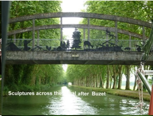
Sculptures across the canal after Buzet